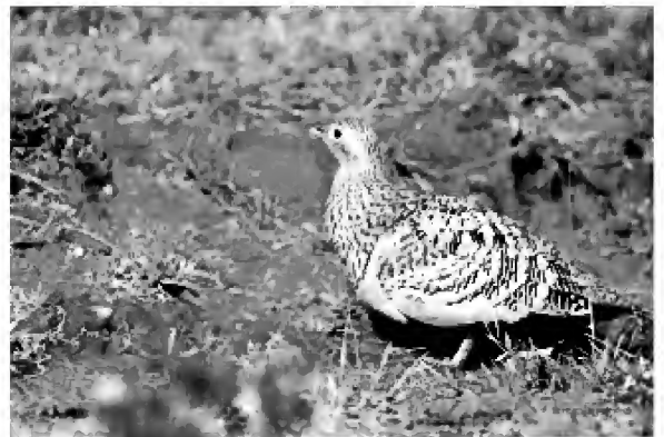
Chestnut-bellied Sandgrouse Pterocles exustus The birds are usually seen in parties of 3 to 5; their coloration on squatting is remarkably obliterative in their native environment.